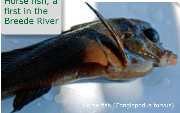
Horse fish (Congiopodus torvus)